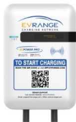
AC Power Pro Level 2 (AC)