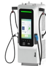
BTC 180kW All-in-One DC Fast Charger