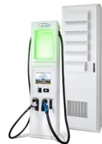
BTC High-Power Split System (DCFC)

Full suite of station options selected and certified for experience and uptime, reducing service/support needs.