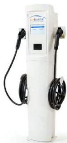
BTC L2 Pedestal Level 2 (AC)