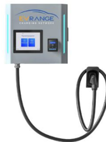
Evisis Wall Mount DC Fast Charger