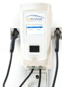
BTC L2 Wall Mount Level 2 (AC)